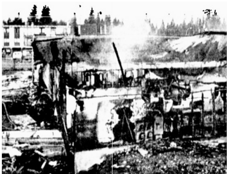
Surrey, B.C. video store lies in ruins follo