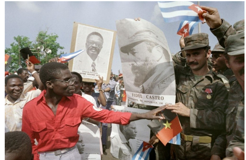
(Cuban soldiers display a poster of Fidel Castro on January 9, 1989, during a ceremony held at the Cuban training camp of Punda, near Luanda, Angola.)

"To the Cuban people internationalism is not only a word but something which they have put into practice for the benefit of large sectors of mankind ... The decisive defeat of the aggressive apartheid forces destroyed the myth of the invincibility of the white oppressor... Cuito Cuanavale marked an important step in the