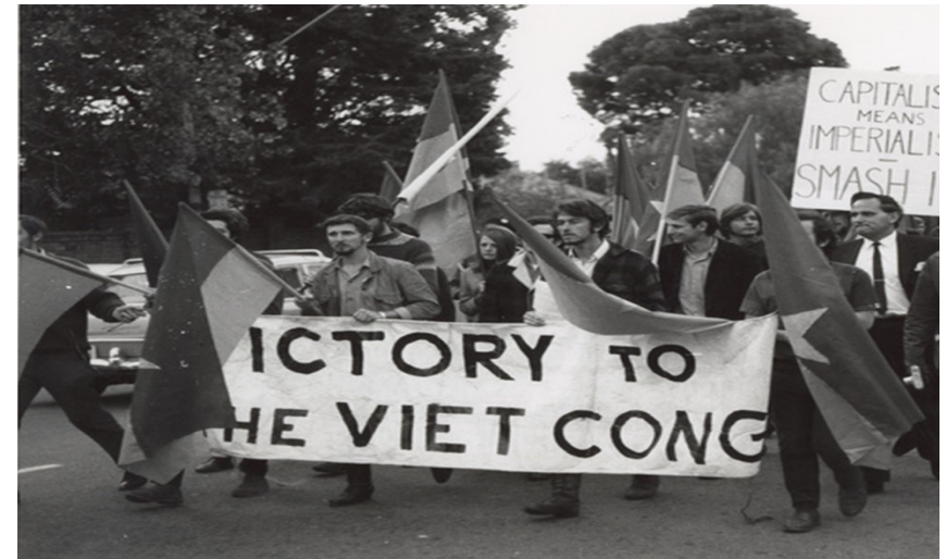
(Anti-Vietnam War March 1970, Adelaide, Australia, banner stating "Victory to the Viet Cong").

The red and blue flags with the star in the centre held in both photos are the flags of the Viet Cong. The banners read "Victory to the Viet Cong" and "Victory to the Viet Cong: Defeat Imperialism Everywhere." By contrast, rally after rally over the last fifteen months has focused entirely on "civilian" casualties to the point where Palestinian resistance fighters are represented in an entirely different dehumanized category to Palestinian and calls for a "ceasefire" which depoliticizes the entire anti-colonial struggle as if settler colonialism is not an ongoing war against the Indigenous. The framing of the Palestine rallies and much of the discourse around Palestine has