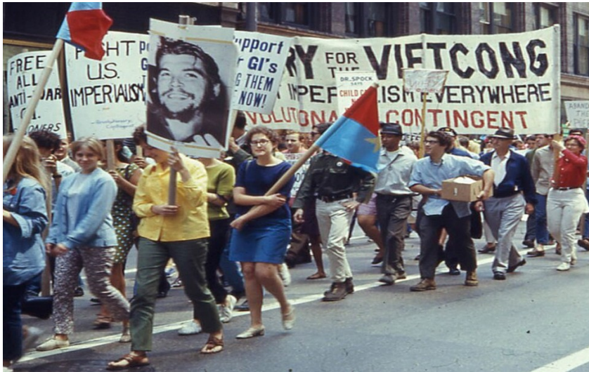
(1968 Anti-Vietnam War March, Chicago U.S.A. Banners stating "Victory for the Viet Cong: Defeat Imperialism Everywhere").