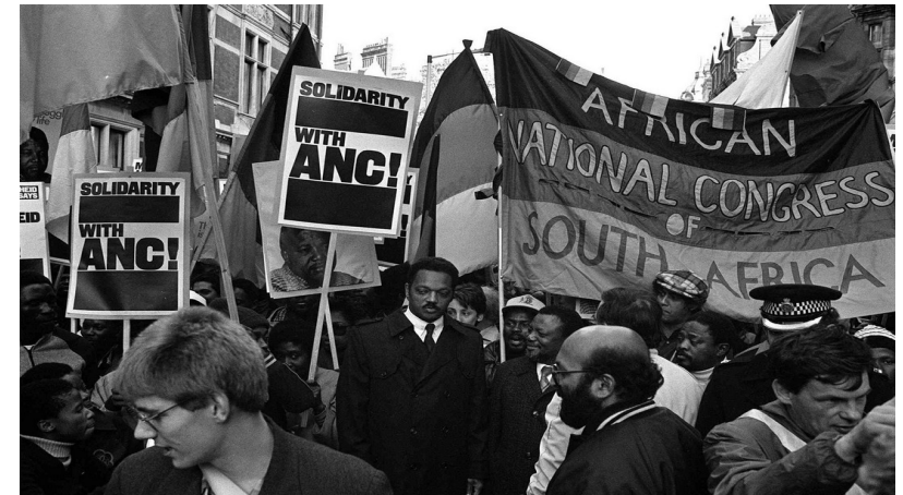
(Protest in London, 1985, with placards reading "Solidarity with the ANC" and a banner reading "African National Congress of South Africa.")