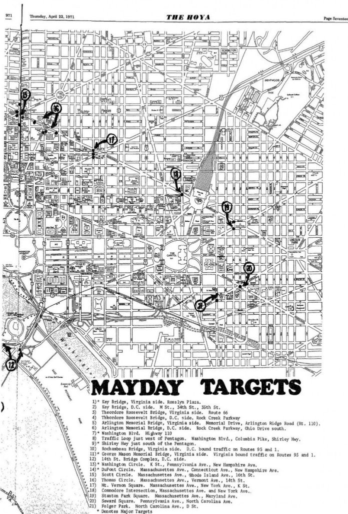
(Mayday Targets, A map of the Central Business District of Washington D.C.).