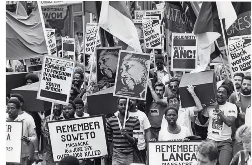
((Anti-apartheid demonstration on 16 June 1985, placards stating “Solidarity with the ANC”, “Remember Soweto”, “Free Nelson Mandela” and “Forwards to Freedom in Namibia and South Africa”).

For myself, I understand anti-Imperialism as rooted in the recognition that the inequalities between our movements and communities can only be abolished not through a deep-seated colonial paternalism, but rather in a joint opposition to Racial Capitalism emergent from our local conditions with shared risk and sacrifice in struggle. Contrary to a Liberal Humanitarianism which presents Palestinians, or