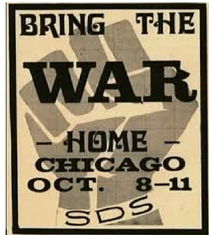
(Bring the War Home – Chicago Oct. 9 th – 11 th SDS.)

Following such tendencies of a militant Anti-Vietnam War movement against the American establishment were the 1971 May Day protests in Washington D.C. These protests brought tens of thousands of anti-war demonstrators to the capital, a result of the culmination of weeks of anti-war activity in the city that spring. Though in contrast to the Days of Rage the protests were framed as "non-violent civil