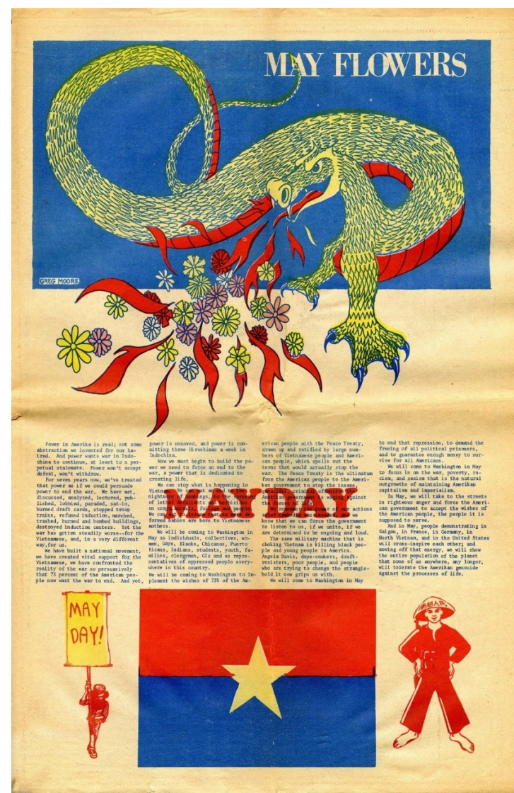
(May Day, picturing the Viet Cong Flag and the Vietnamese dragon breathing flowers).